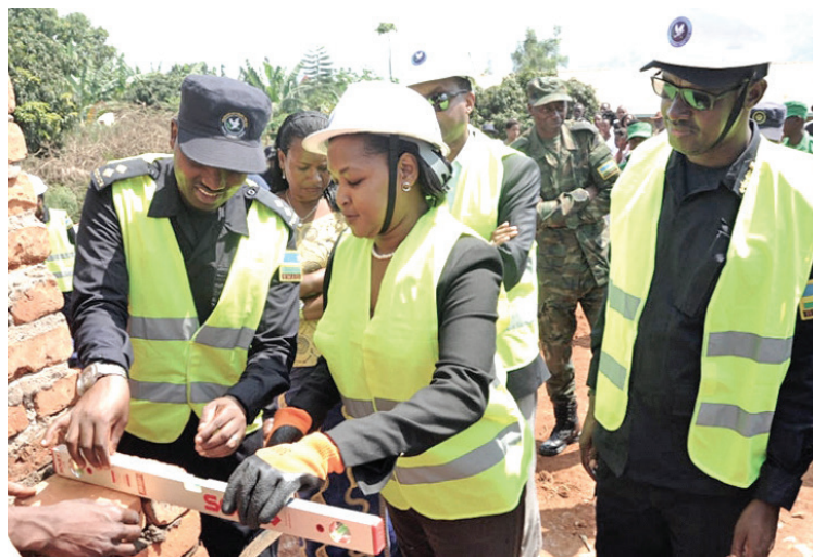
Minister of Youth, Rosemary Mbabazi launching the Police Month in City of Kigali.

“The theme—keeping Kigali clean, green and safe—is an impactful campaign which should be scaled up to a ‘clean, green and safe Rwanda, we will