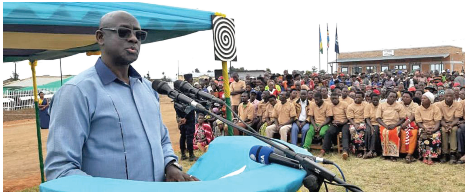
The Minister of Justice and Attorney General, Johnston Busingye addressing residents of Cyumba in Gicumbi District.

The Minister of Justice and Attorney General, Johnston Busingye.