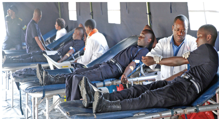
Police officers donating blood.