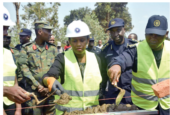
The Minister of Public Service and Labour, Rwanyindo Fanfan, Governor Fred Mufurukye and DIGP-Administration and Personnel Juvenal Marizamunda launching the Police Month outreach activities.

The first week embarked on fighting narcotic drugs and psychotropic substances, one of the major pressing security issues affecting youth development in the country. The week was characterized by disposing of drugs impounded in separate Police