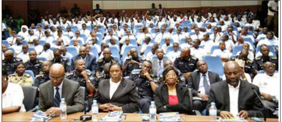
Leaders and partners attending the celebration

This means that campaigns including human trafficking, drug abuse, gender based violence and road safety, were bent along the line of the theme to increase public awareness on the protection of children.