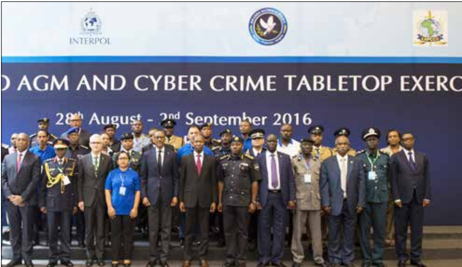
Chiefs of police from EAPCCO and Rwanda government Ministers join HE Paul Kagame in group photo

President Paul Kagame called on Chiefs of Police in the eastern Africa region to strengthen their cooperation to tackle crimes, especially the sophisticated ones that are emerging as a result of latest developments in Information and Communication Technology (ICT).