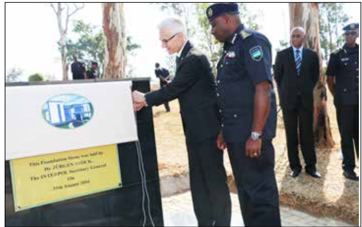
Interpol SG Dr. Jurgen Stock unveiling the foundation stone for the construction of the Regional cyber crime centre of excellence

August 2016, uses a case scenario where a vulnerable 20-year old girl was lured away from her home by a human trafficking ring that essentially lied to her about getting a job.