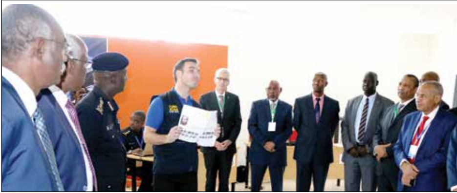
Ministers from EAPPCO being explained on the exercise set