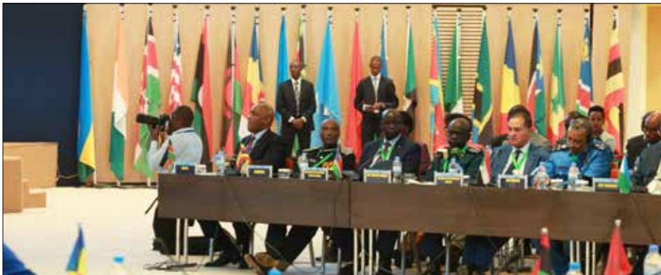
Participants during the 18th EAPCCO AGM