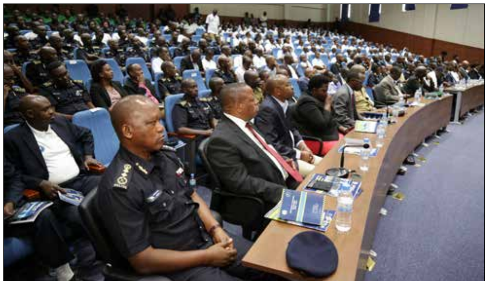
Participants during the celebration

In line with crime prevention, RNP also embarked on addressing concerns related to human security as a means to ensure all