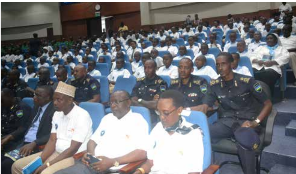
Participants during the celebration

The government is supportive in other welfare schemes like health insurance schemes, armed forces shop, promotions, increasing salaries for servicemen, and transport for officers to and from work, peacekeeping missions and establishing canteens to provide meals to officers on duty at fair pay, among others.