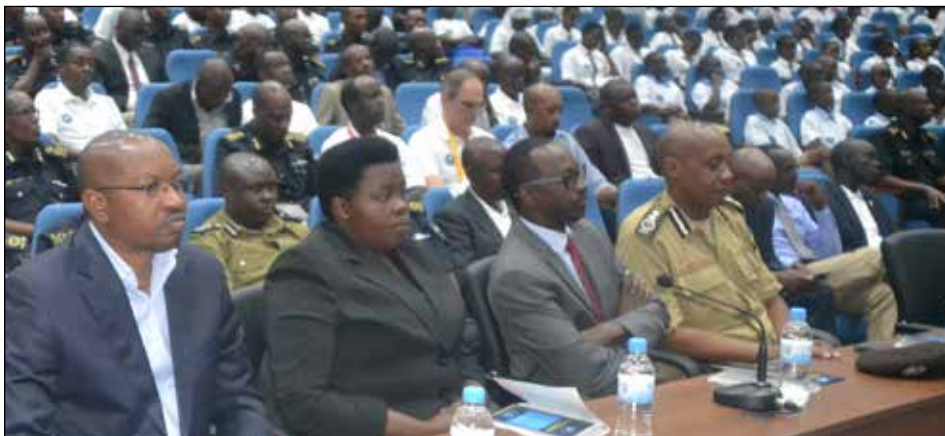
Police officers and partners attended the event

Presiding over the official launch in the