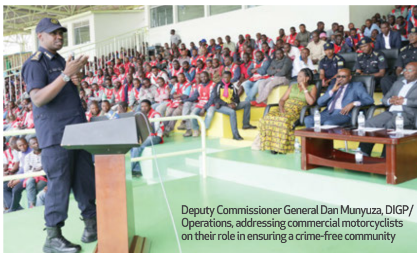
Deputy Commissioner General Dan Munyuza, DIGP/ Operations, addressing commercial motorcyclists on their role in ensuring a crime-free community

health insurance ( Mutuelle de santé), distribution of solar systems to the needy in the framework of the national policy of off grid rural electrification and the construction of football pitches, among others.