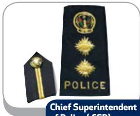
Chief Superintendent of Police (CSP)