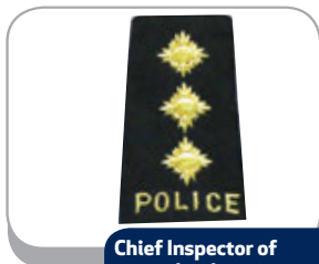
Chief Inspector of Police (CIP)