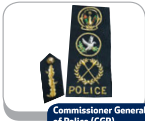
Commissioner General of Police (CGP)