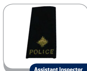
Assistant Inspector of Police (AIP)