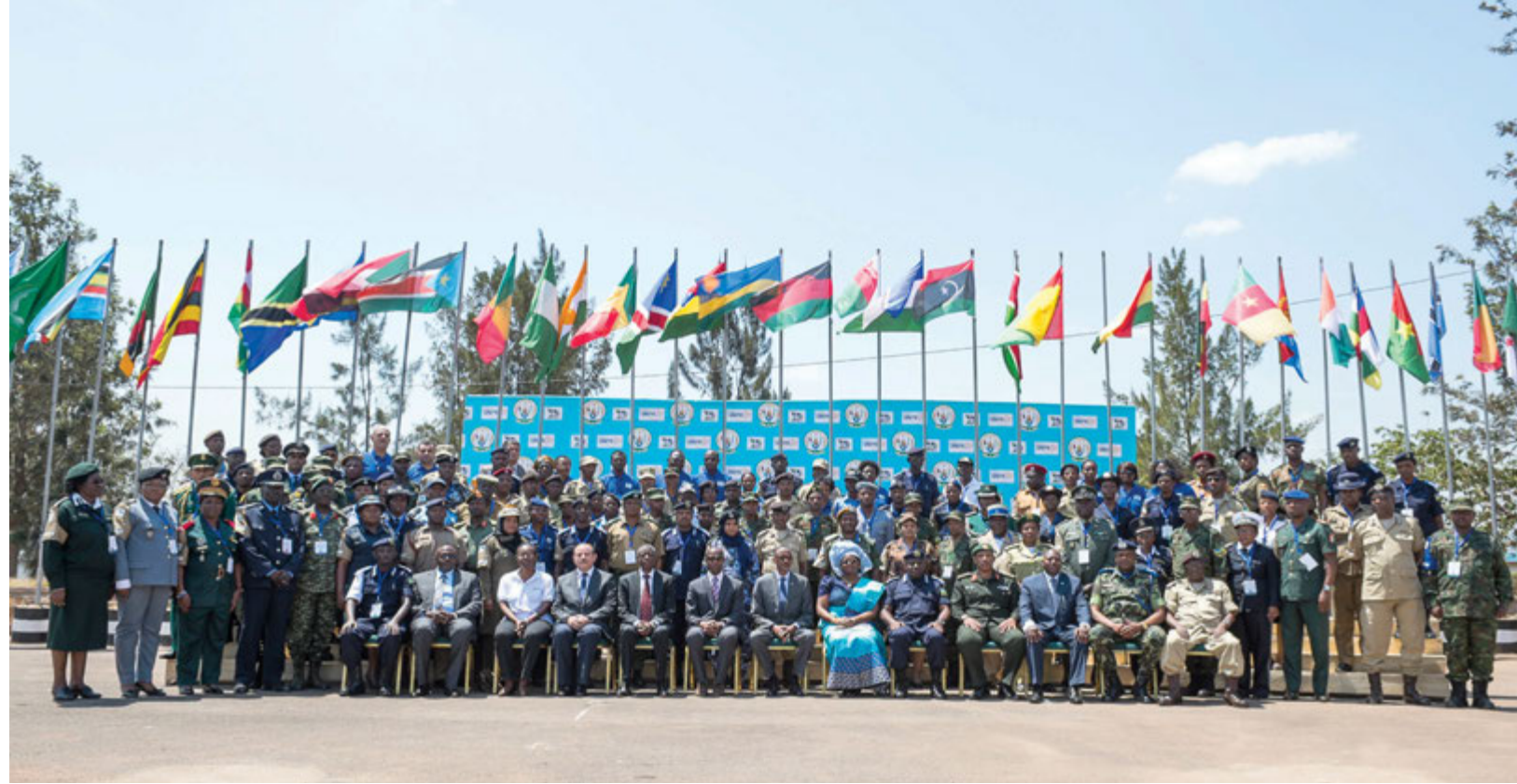
H.E Paul KAGAME officiates the opening ceremony of a Regional Command Post Exercise on combatting VAWG