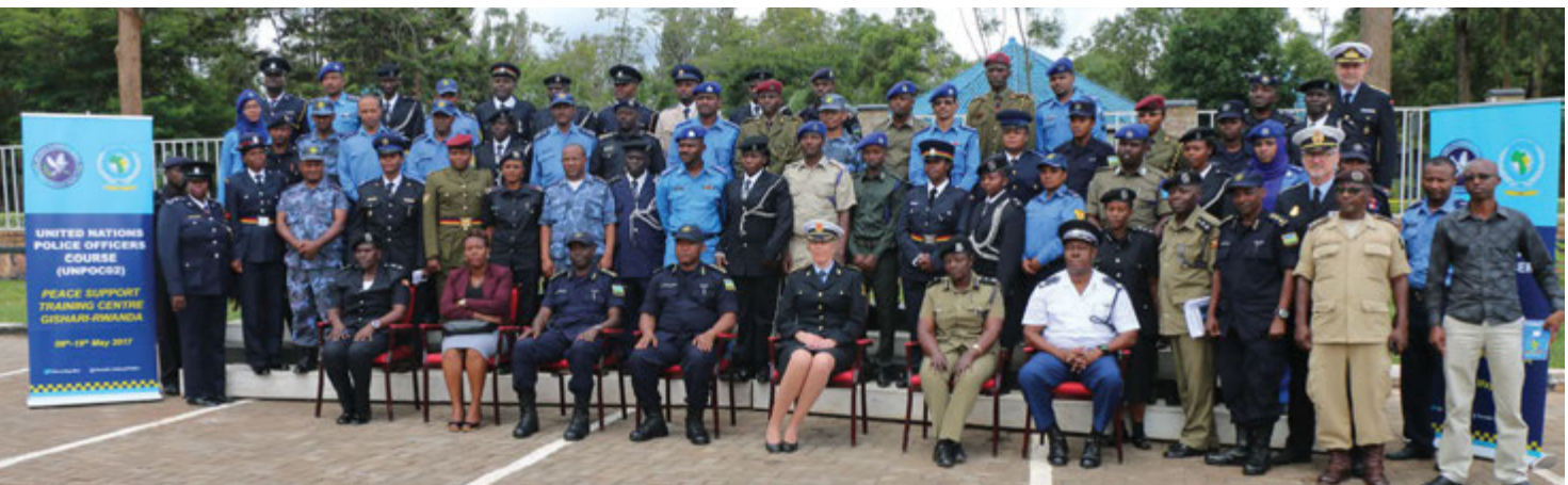
Deputy Commissioner General Juvenal MARIZAMUNDA, DIGP/AP presides over the closing of the second United Nations Police Officers Course (UNPOC) at the Peacekeeping Training Centre in Gishari

RNP will continue to increase its participation in Peace Keeping Operations with the prime objective of contributing to peace where it is most needed. In so doing, the Department of PSO of RNP will provide opportunities to as many men and women in this institution to participate and make a difference.