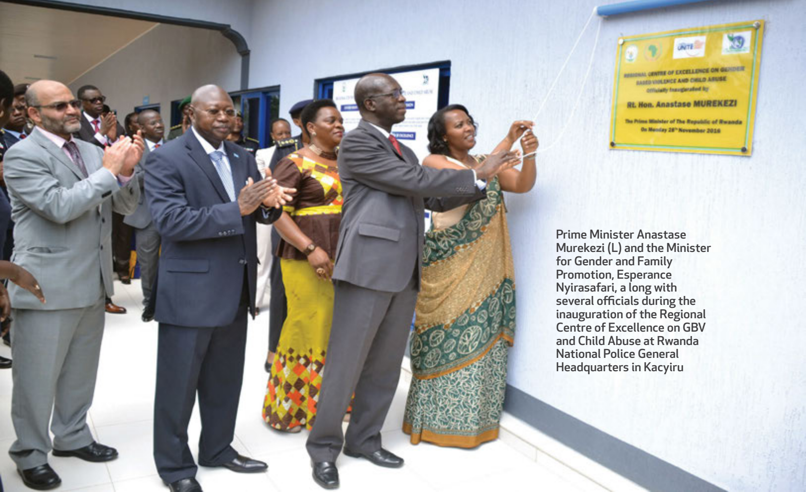
Prime Minister Anastase Murekezi (L) and the Minister for Gender and Family Promotion, Esperance Nyirasafari, a long with several officials during the inauguration of the Regional Centre of Excellence on GBV and Child Abuse at Rwanda National Police General Headquarters in Kacyiru