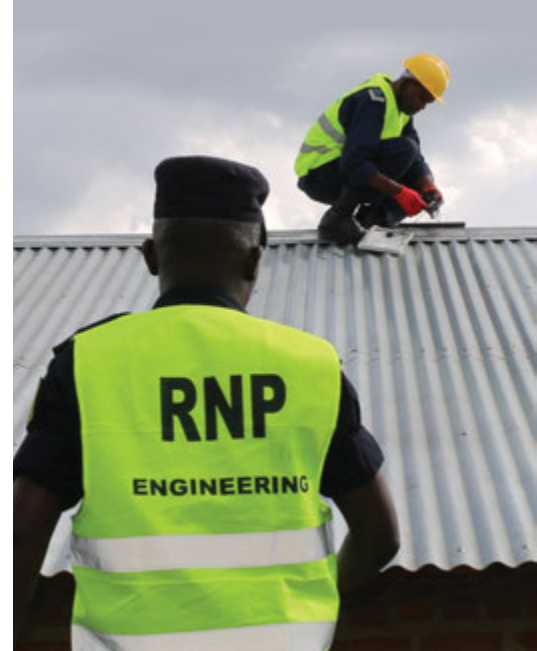
As part of the Police Week 2017, RNP donated solar power systems to over 3500 household that are far from the grid

Human security activities geared towards improving the wellbeing of community members have been initiated. They include the construction of houses for the vulnerable households, participation in "Girinka" national project, supporting motorcyclist cooperatives to build their capacities, afforestation- 500 Ha were planted by Police countrywide, helping vulnerable families to pay