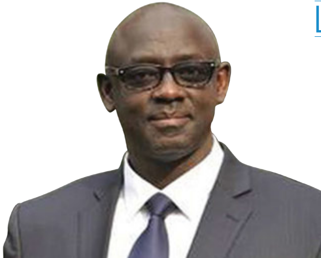
Hon. Johnston BUSINGYE Minister of Justice / Attorney General