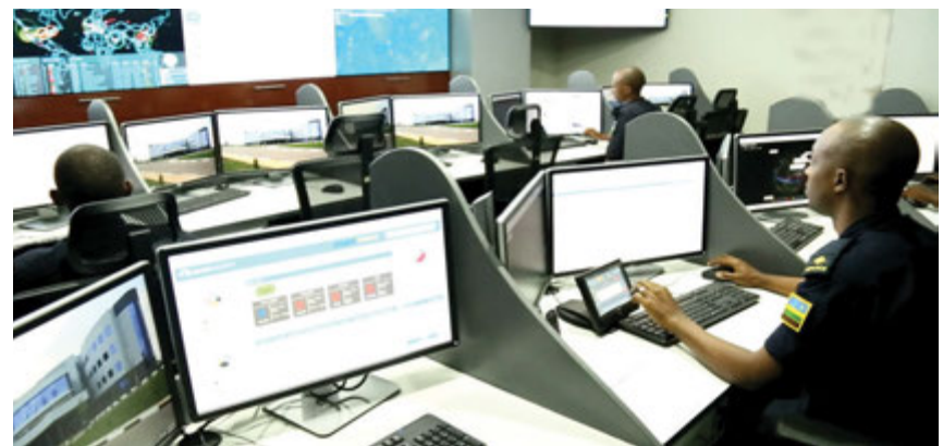
RNP Cyber Centre also accommodates the digital forensic laboratory

Since organized crime has entered in the cyberspace, the public should know that RNP is equipped to make them safer and bring criminals to justice. Cyber-related crimes are relatively a new phenomenon in Rwanda and RNP is very much aware of its existence.