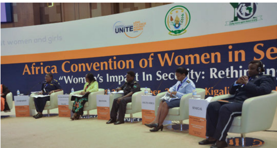
Participants during the Africa Convention of Women in Security Organs (WISO) hosted by KICD

One of the outcomes of KICD is the construction of Africa’s Regional Centre of Excellence on GBV and Child Abuse based at Kacyiru Police Head Quarters. The foundation stone for the centre was laid by H.E. Ban Kii Moon and its construction was financed by World Bank and UN partners.