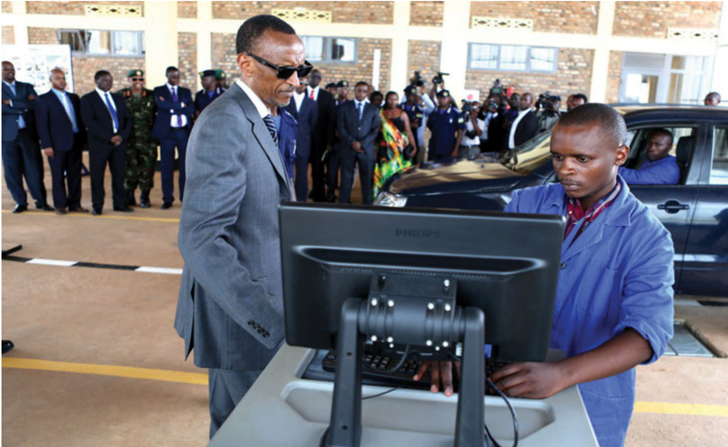
The President visiting Gishari Integrated Polytechnic (GIP) - 17 Mar 2014

"...People who are pursuing their education at different levels need to be taught technical skills and get internships to become competitive on job market. Young people should have a positive attitude towards TVET.."