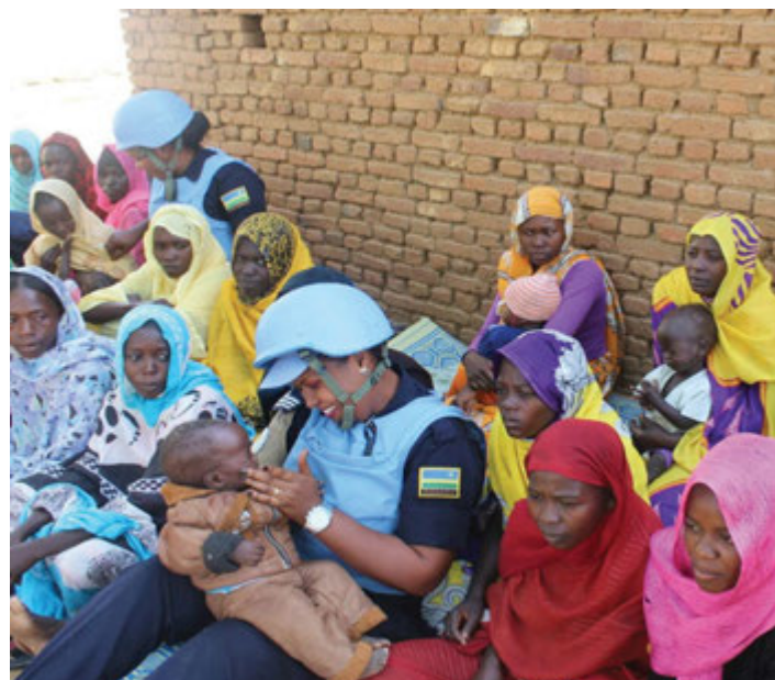
A Rwandan Police Peacekeeper in UN Mission providing social services to internally displaced women and children

In the year 2009, the Directorate of Gender Promotion was created under the Department of Human Resource Management and Development. The objective was for the Directorate to focus on gender specific concerns within the Police and to implement reforms geared towards uplifting police women—especially in career advancement, enhance networking, prevent all forms of discriminations against women, share information on Gender Based Violence (GBV), reduce crime targeting women and children as well as liaise with relevant partners in gender promotion.