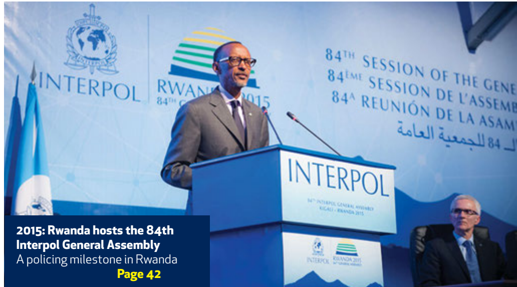
2015: Rwanda hosts the 84th Interpol General Assembly A policing milestone in Rwanda Page 42