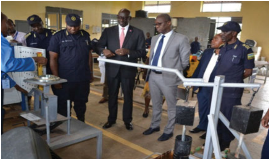
The Minister of Justice and Human Rights of Mali, Mamadou Ismaila Konate and his host the Minister of Justice and Attorney General of Rwanda Johnstone Busingye and Inspector General of Police visited and were conducted to a guided tour at Gishari Integrated Polytechnic, 09th March 2017