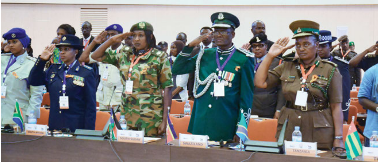
KICD hosted the first ever Africa Convention of Women in Security Organs (WISO) under the theme: “Women’s impact in security: Rethinking Strategy. It brought together drew about 250 delegates from 38 countries.”