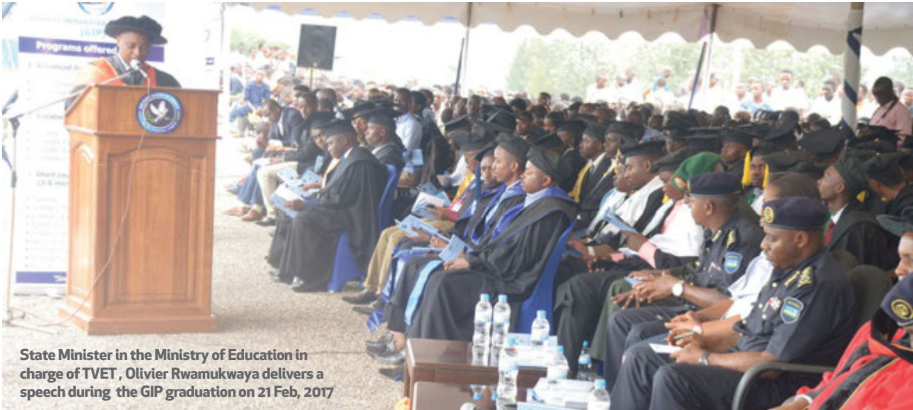
State Minister in the Ministry of Education in charge of TVET, Olivier Rwamukwaya delivers a speech during the GIP graduation on 21 Feb, 2017