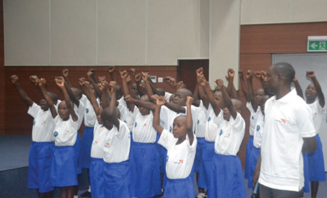
Imitavu, a group of youngsters who are devoted to crime prevention performing at an event

The RNP Community Policing approach is hinged on the core values of: Justice and respect for human rights, gender sensitivity, Integrity, teamwork, openness, accountability, partnership and a community relations focus, professional conduct, efficiency and effectiveness.