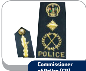
Commissioner of Police (CP)