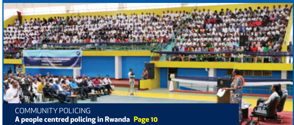
COMMUNITY POLICING A people centred policing in Rwanda Page 10

The RNP in Sports IT'S MORE THAN GAMES Page 50