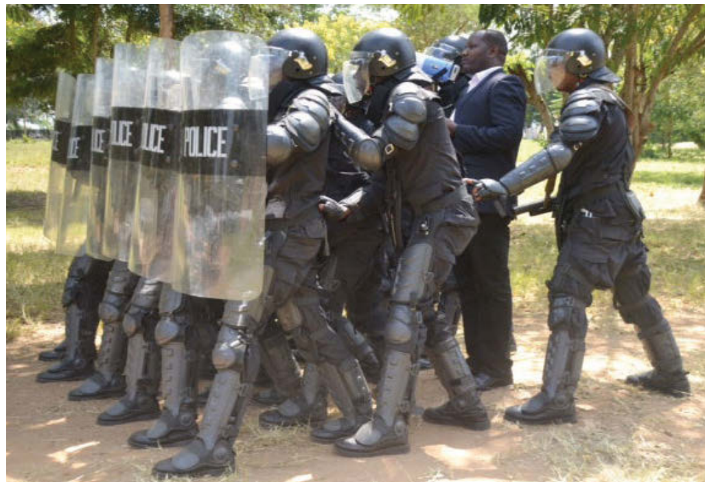
Officers attached to the crowd control unit demonstrating some of the skills of riot control

Rwanda National Police remains deliberate and committed to acquisition of the best and most relevant equipment for the force.