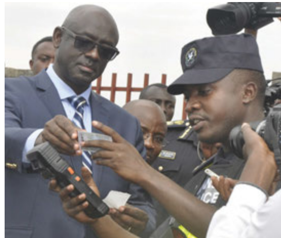
Minister Busingye launching the hi-tech road traffic control integrated system

The department has acquired state-of-the-art equipment including breathalysers for alcohol detection, speedometers and speed governors for vehicle speed control, a Hand Held Terminals (HHT) cashless system that requires penalised traffic offenders to pay the fine using smart card (i.e. Visa), and an Automated Number Plate Recognition (ANPR) machine that automatically