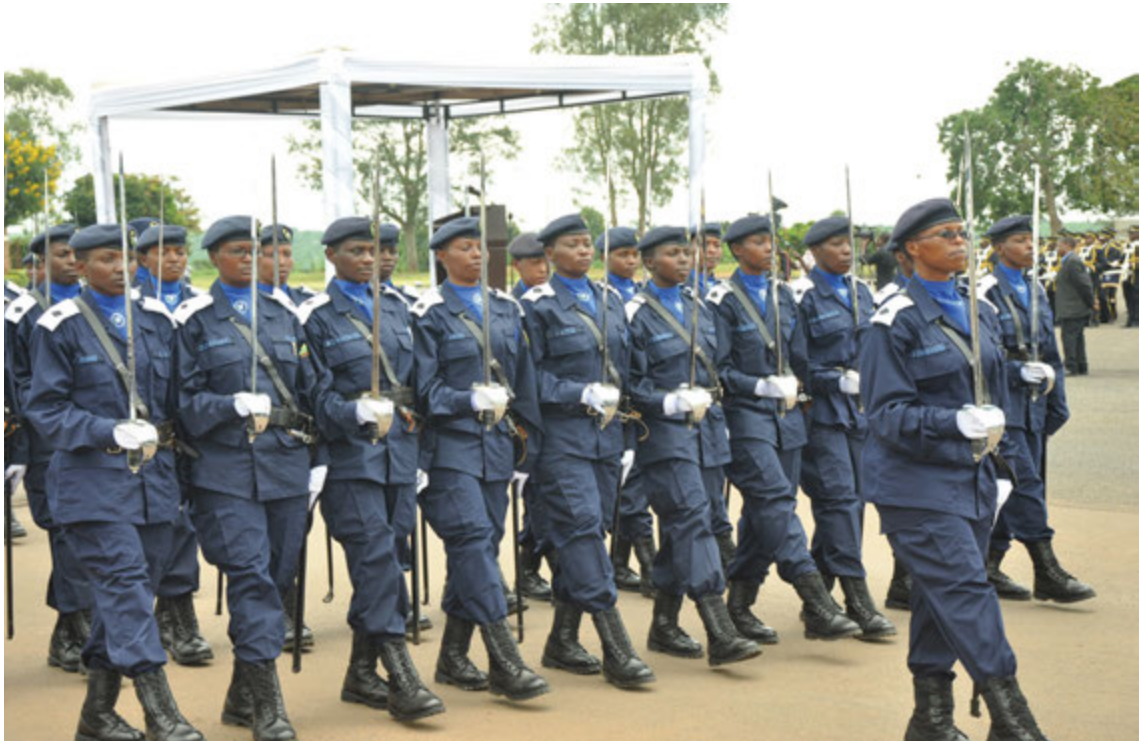
A platoon of female officers during a cadet pass out

Today, the number of female RNP officers has increased from less than 10% in 2009 to 21% of the total force in 2017. This is 1% higher than the minimum requirement within a UN ideal contingent for Peace Support Operations. By the Rwandan standards, however, this percentage remains low and efforts are underway to increase it as required by the national guiding principles. For instance, the Rwandan Constitution requires that at least 30% of leadership positions within government institutions be occupied by women, a requirement that RNP still has to meet.