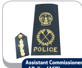
Assistant Commissioner of Police (ACP)