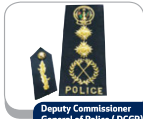
Deputy Commissioner General of Police (DCGP)