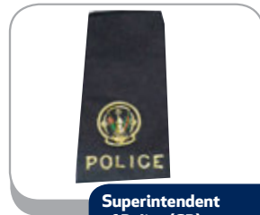
Superintendent of Police (SP)