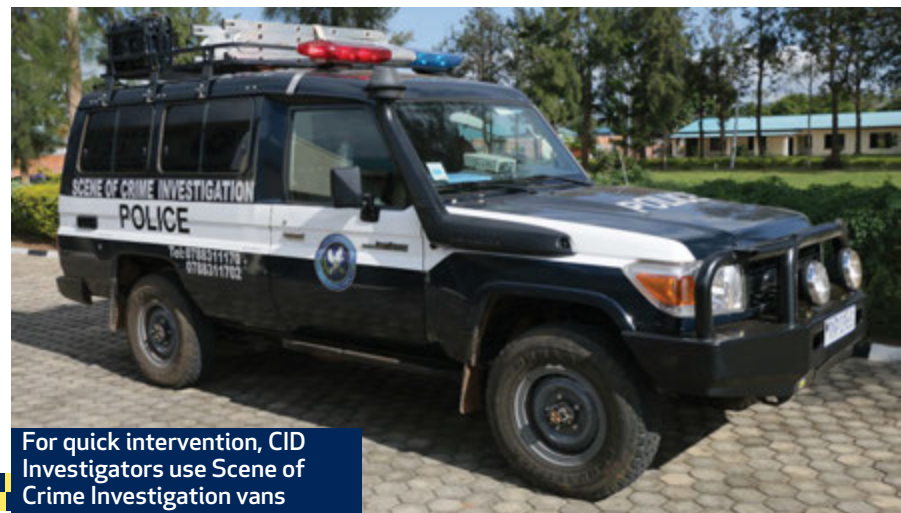
For quick intervention, CID Investigators use Scene of Crime Investigation vans

With emerging and increasing cross-border crimes, RNP equally prioritized bilateral cooperation with several law enforcement agencies