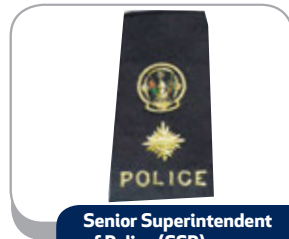
Senior Superintendent of Police (SSP)