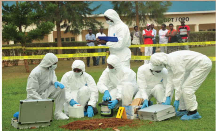
RNP officers collecting evidence at a scene of crime

The CID is one of the major components that constitute