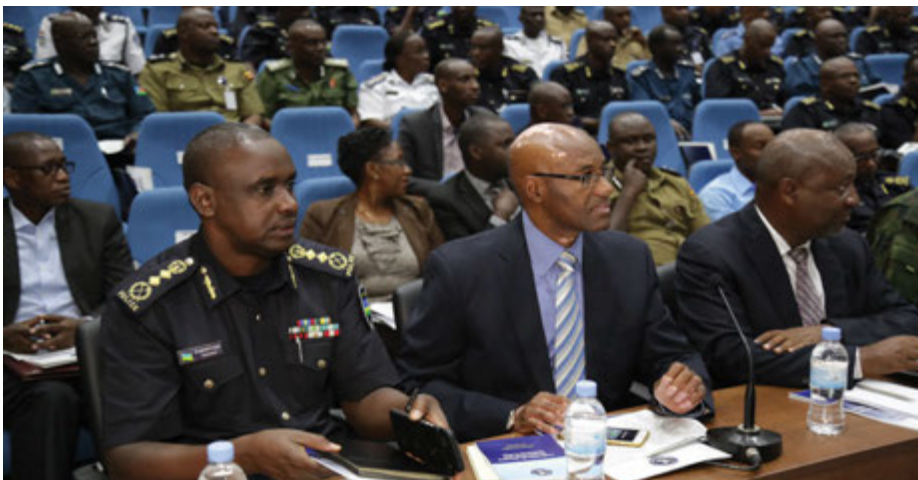
Senior Police Officers from different African countries, officials and experts attending a symposium on peace security and justice

Combating transnational organised, and cross border crime through networking and information exchange is a major one. Rwanda National Police is linked to the Interpol Police Information System – the I-24/7, this has been extended to the customs and immigration working stations, providing capability for instant access to communication, information exchange and crime related data with INTERPOL General Secretariat as well as with 189 other INTERPOL members using the system.