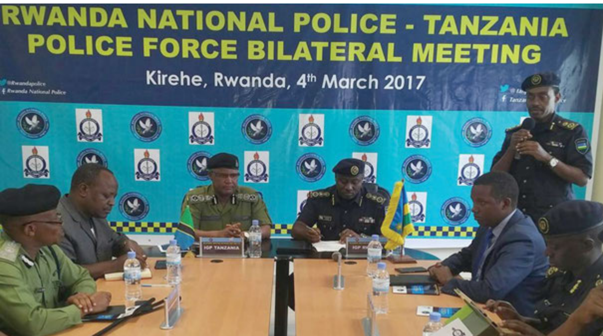
Rwanda National Police (RNP) and Tanzania Police Forces entered a bilateral agreement that highlights major areas of co-operation, including cross-border security, exchange of information on criminals, expertise and joint training among others