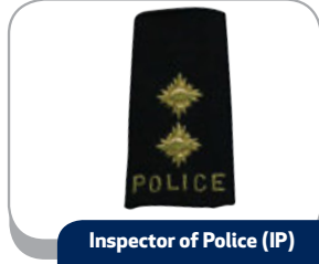
Inspector of Police (IP)